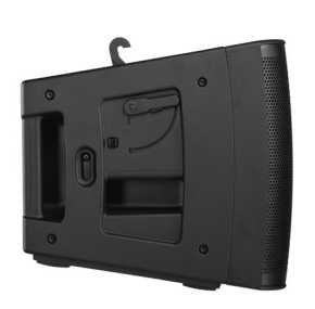
SOLO™ Rigging System

Housed in a rugged ABS enclosure that results in both light weight and long-term durability, the KLA12 features a 12-inch low-frequency transducer coupled with a 1.75-inch compression driver housed on a multiple diffraction aperture waveguide.